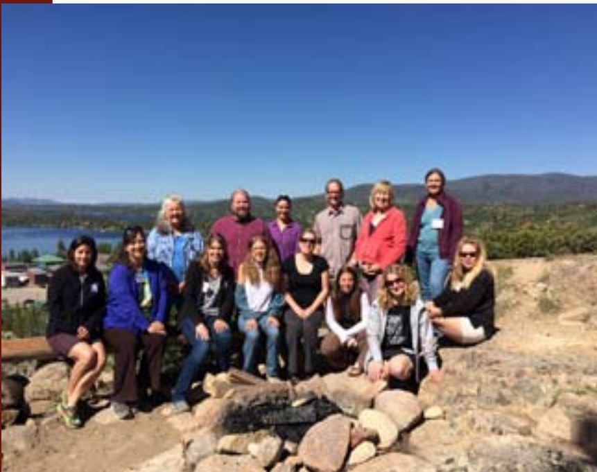
Regional EE Leadership Councils at Shadowcliff Mountain Lodge discussing priorities for PreK-12 EE.

Thank you, Pisces Foundation for making this effort possible!